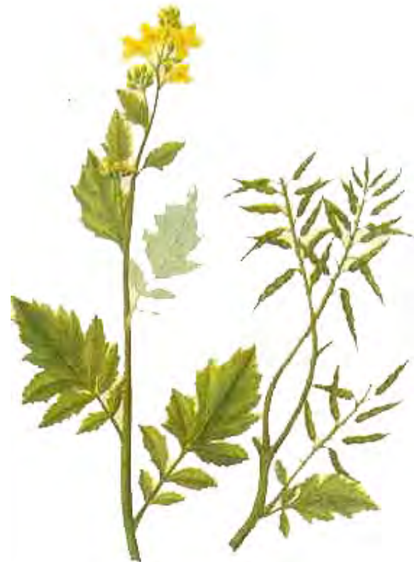
图 213 白芥